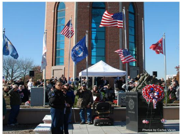
PLACING OF THE WREATH ON VET'S DAY SERVICE