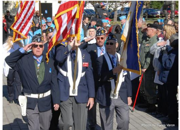
NASSAU COUNTY COLOR GUARD AT THE VETERANS DAY SERVICE AT EISENHOWER PARK.