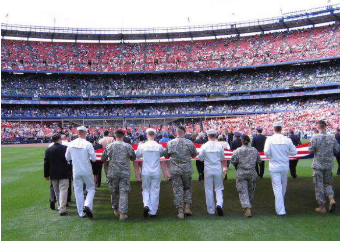
VETS HONORED AT SHEA STADIUM

MEMBER NATIONAL AMERICAN LEGION PRESS ASSOCIATION NEW YORK STATE LEGION PRESS ASSOCIATION